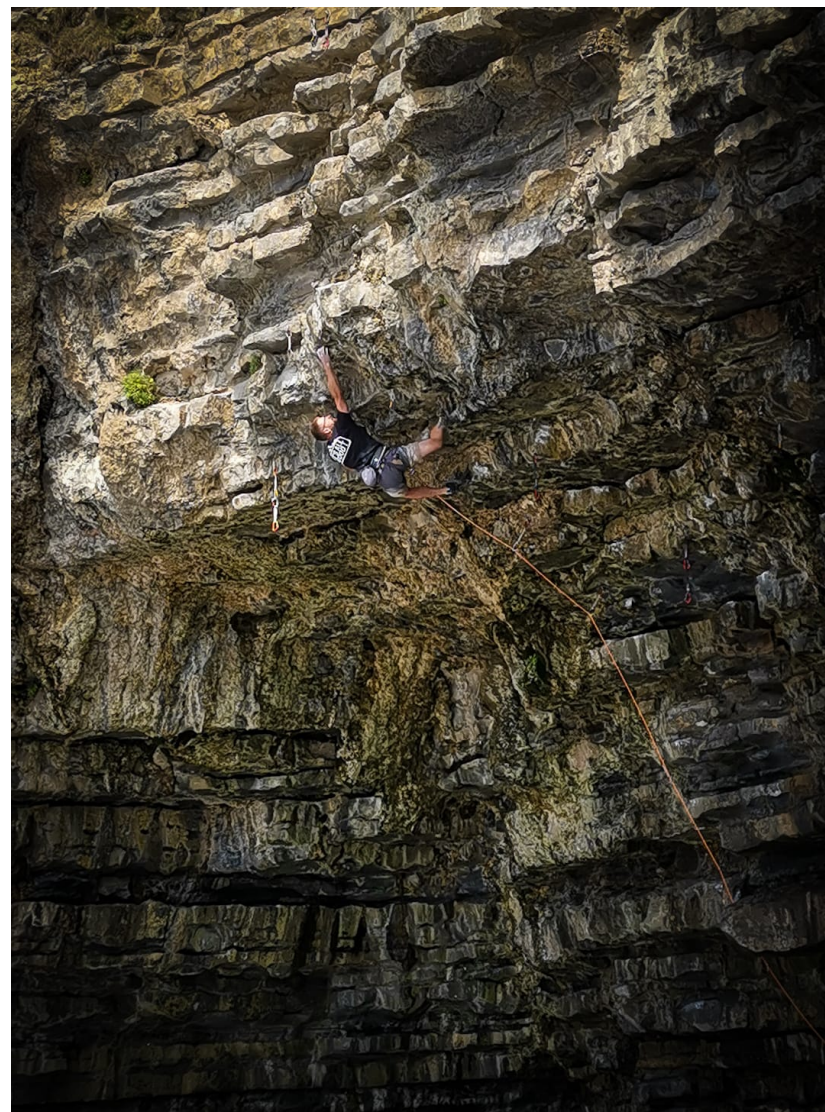
Stout Dugout - 7c+