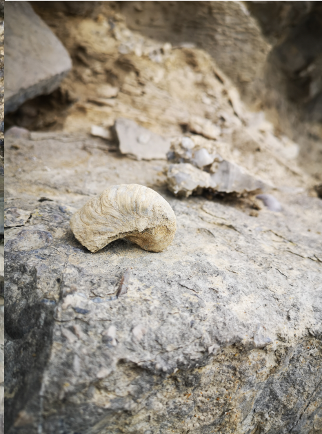
Abundance of fossils