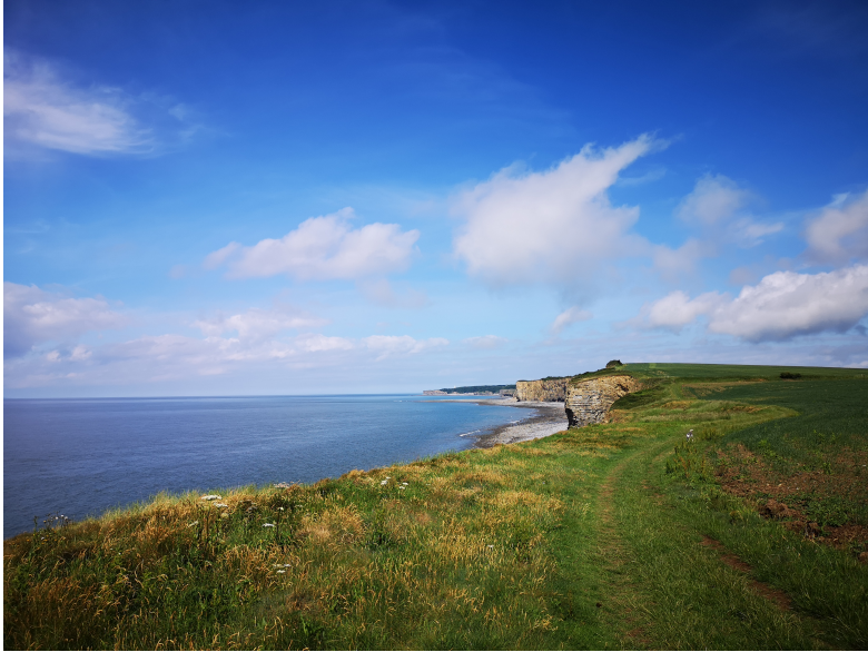
Lovely views on the walk in