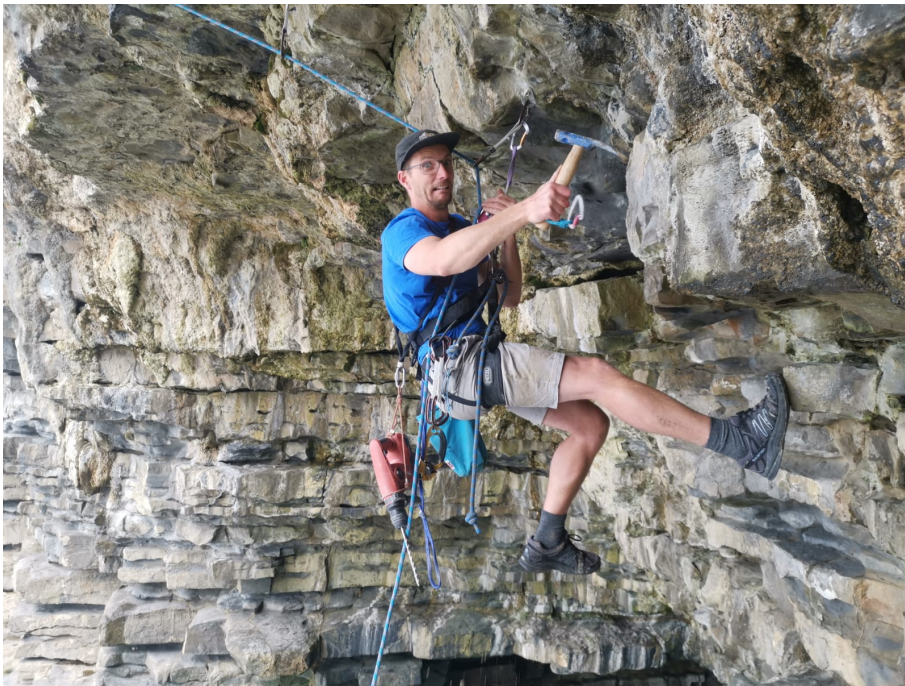
How big does this jug need to be!?