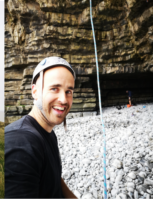
Always measure your dome before buying a helmet online