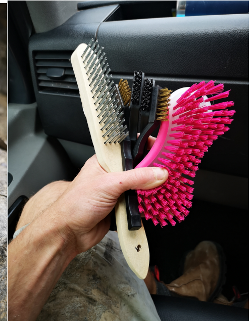
Thanks to O'Donovans hardware store