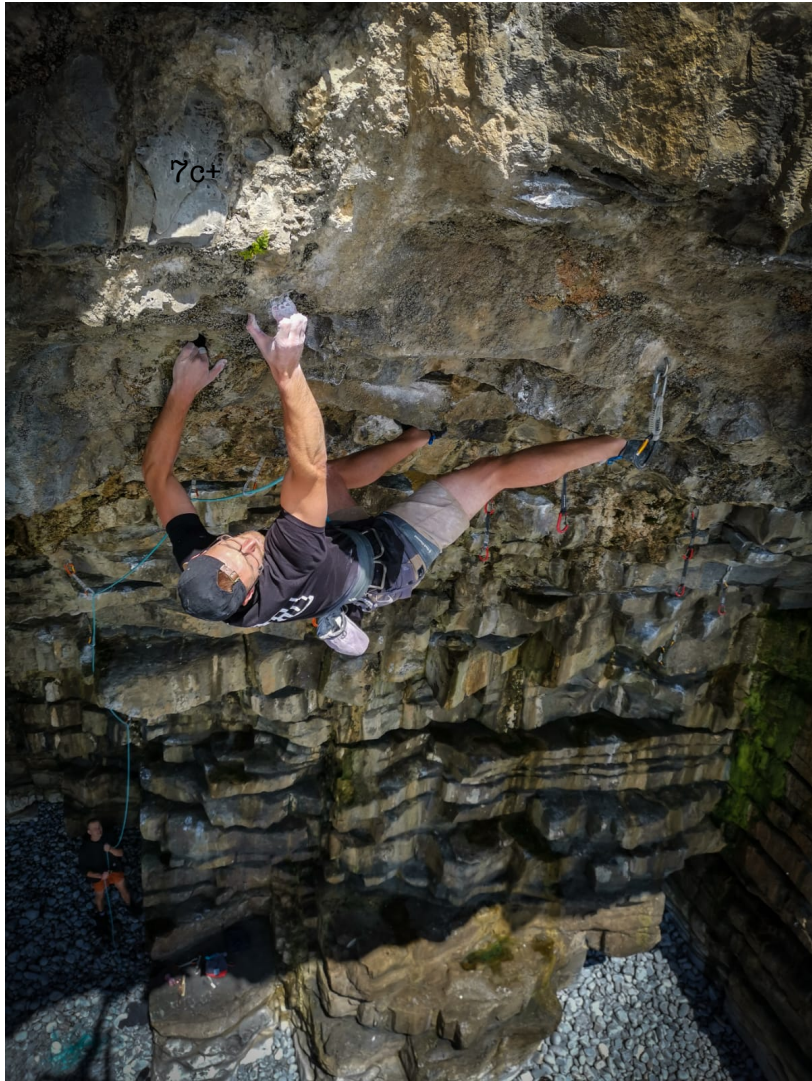
Crux at the top is a theme here...