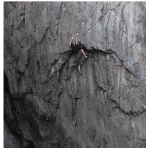
Bowen to the inevitable