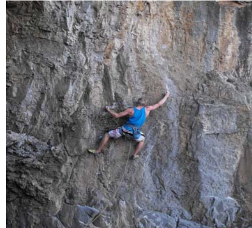
'When I'm 64'